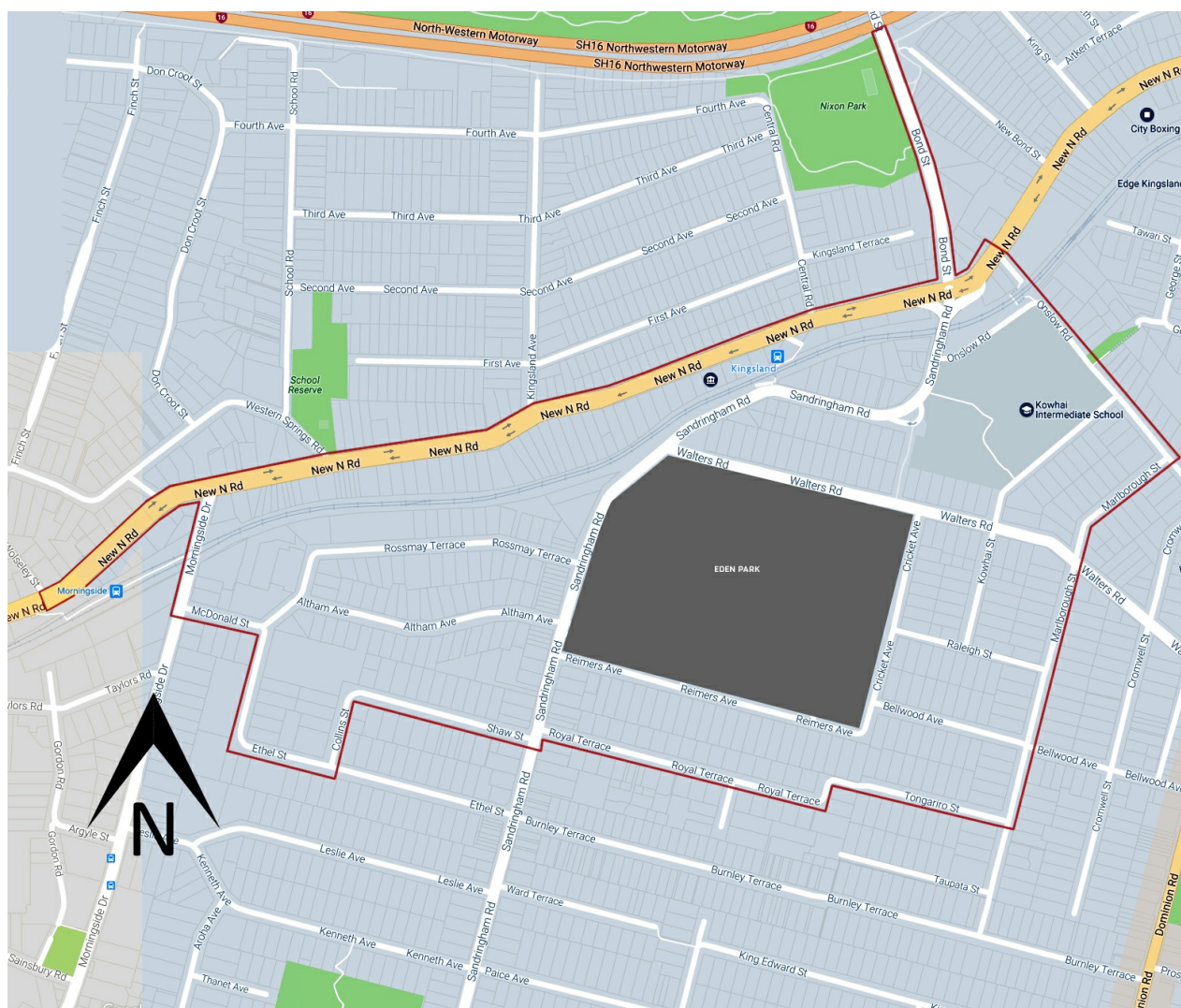
Map B: Eden Park Clean Zone

The area shown in Map C, being the area bordered by and including: