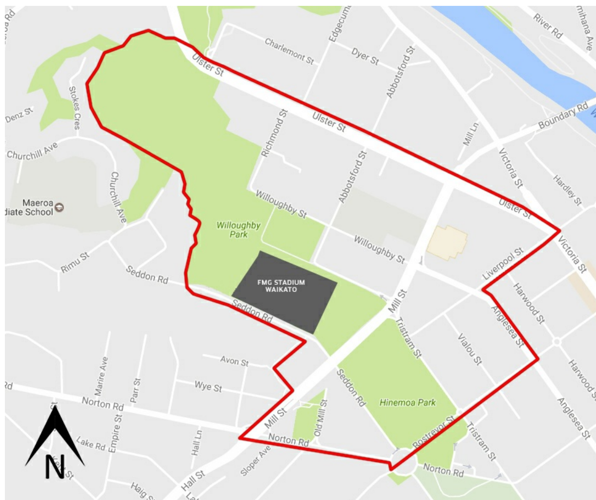
Map C: FMG Stadium Waikato Clean Zone

The area shown in Map D, being the area bordered by and including: