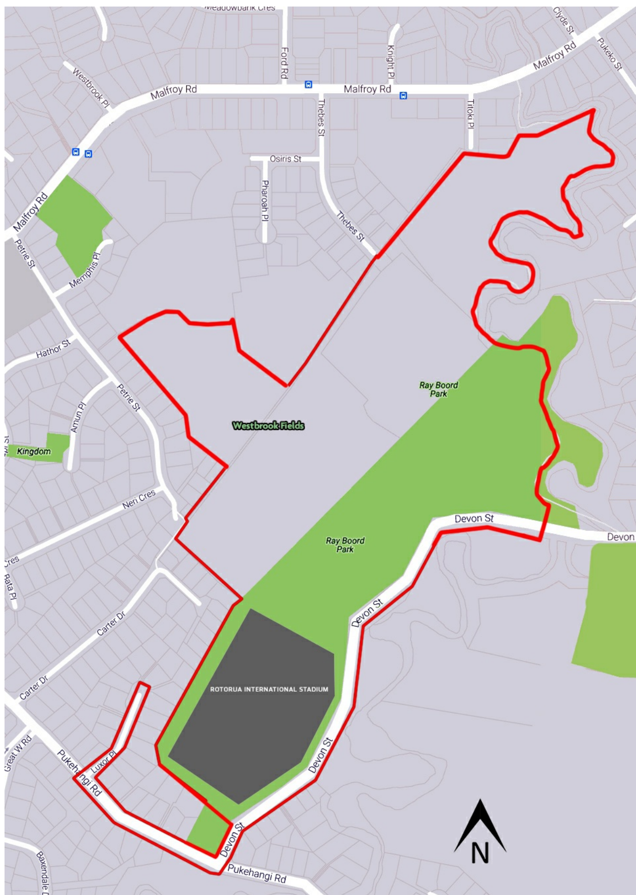
Schedule 5: Westpac Stadium, Wellington Proposed Clean Zone